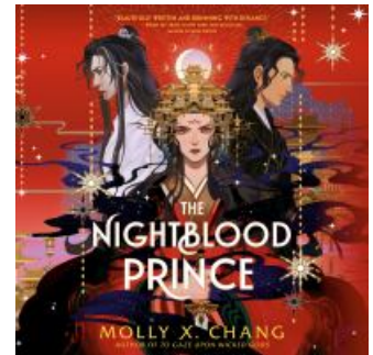
The Nightblood Prince Molly Chang